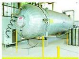
Co2 OPERATION, Co2 TANK AND BOTTLE FILLING