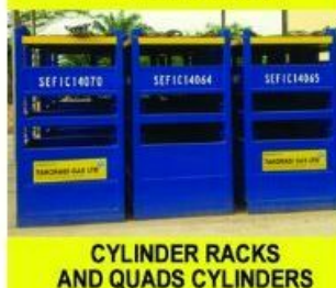
CYLINDER RACKS AND QUADS CYLINDERS