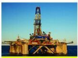
OIL AND GAS PRODUCTION