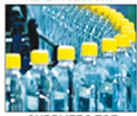
SUPPLIERS FOR BEVERAGE COMPANIES