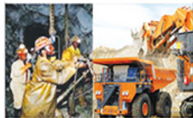
SUPPLIERS FOR MINING COMPANIES