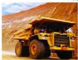
SUPPLIERS FOR MINING COMPANIES