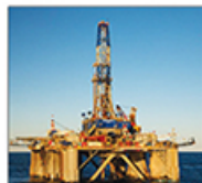
OIL AND GAS INDUSTRIES