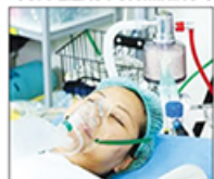
MEDICAL OXYGEN FOR HEALTH SECTORS