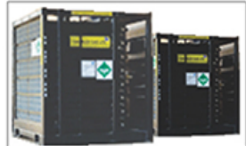
64 CYLINDER QUADS